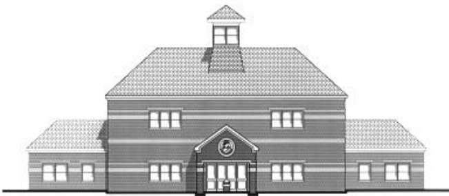
Architect's rendering of the new Police facility now under construction.