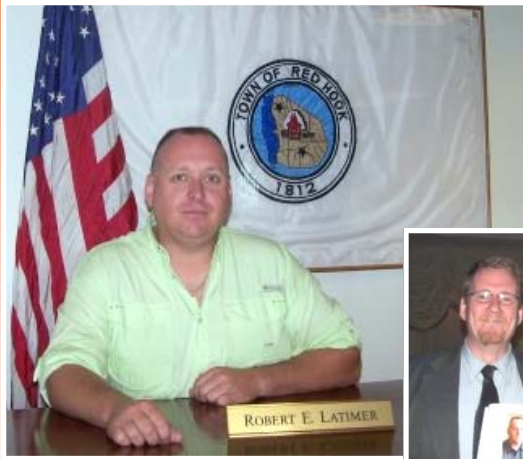
Named American Red Cross HOMETOWN HERO